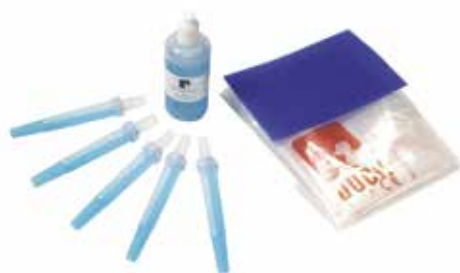
The Distal Duck Kit keeps instruments moist after use and protected during transport for reprocessing

With that, CSSD departments inherit the responsibility to effectively reprocess instruments of all types and complexities, within the scope of the processing instructions provided by the medical device manufacturers. These instructions may typically make use of pre-cleaning solutions that are used even before the medical device enters the central sterilization department (CSSD). CSSDs also need an effective and appropriate washer-disinfector installed to